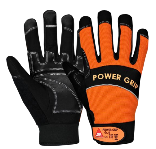
Image: second system breathability Image: second system water protection Image: second system cut protection Image: second system sensitivity Image: second system dry grip Image: second system wet/oil grip